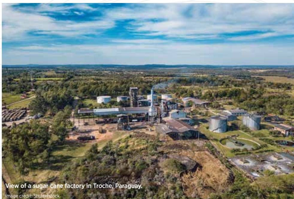
View of a sugar cane factory in Troche, Paraguay.

More financing opportunities should be created in the country to boost the rapid development of renewable energy projects. For instance, guarantees, credit lines and other dedicated financing mechanisms can help attract the interest of project developers and investors. Additionally, climate finance support from international institutions should be considered for the development of renewable energy and energy efficiency projects.